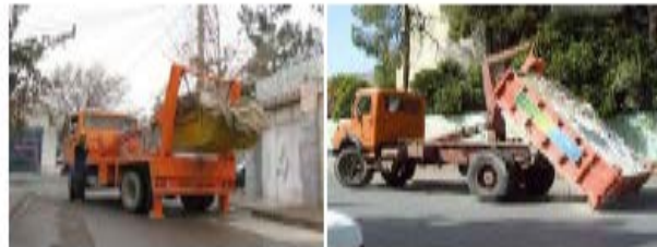
Figure 3. Mechanized system for collecting waste and urban waste

By examining the depleted wastes in the landfills in Mashhad and obtaining the type and amount of waste that are commonly found in the weeks and months of the year, accurate and correct planning can be made in the field of executive recycling of Mashhad and other large metropolises in the same manner.