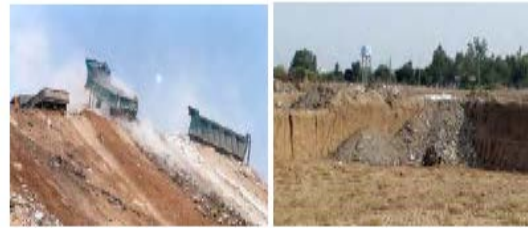
Figure 1. The location of waste discharge and construction debris

center of the city, which would increase the costly transportation costs. The sites for disposal and burial of construction waste should be at least 300 m from the residential areas and ordinary roads, and 150 m from the surface of the rivers and rivers. The high volume of debris in cities and the cost of transporting to distant places has made it a landfill site that violates the law around towns. Determining the proper landfill should be carried out with the cooperation of various institutions and extensive studies have been done in this field that will have the least environmental impact on the climate and vegetation around the site of disposal.