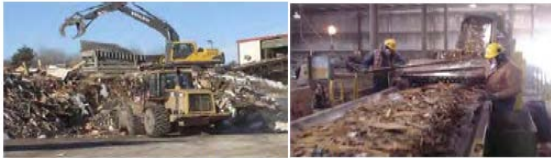
Figure 5. Mechanical separation of construction waste

- In the recycling facilities (more sophisticated equipment): Mixed separation method increases recovery time associated with more costs.