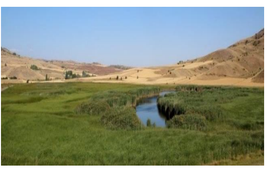
Figure 1. A view from the Kaz Lake Wetland.

Kaz Lake is a locally important wetland located in the Central Anatolia Region of Turkey (Figure 1) . It is located within the borders of the Zara district of Sivas province. Kaz Lake is a very small-scale terrestrial lake. Almost all the shores of Kaz Lake are covered with reeds and aquatic plants. The biodiversity and being on one of the bird migration routes in Turkey, as well as being a host, feeding, and breeding area for migratory birds, makes Kaz Lake important (SEP, 2021). For this reason, every year bird watchers and nature lovers come and stay here to observe.