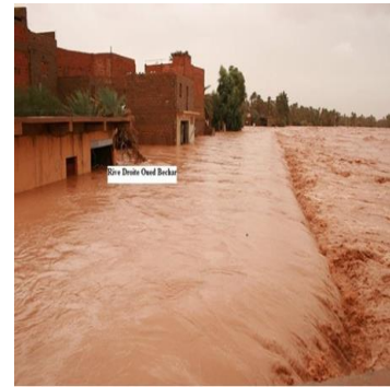
Figure 2. The flood of October 2008 (homes flooded)

The City of Béchar (southwest) was known for the catastrophic flooding associated with the Béchar Valley flood in October 2008, with rainfall occurring over days resulting in the overflow of the Béchar Valley ( Figure 2 ). Table 1 represents the interventions of civil protection to the damage of this flood.