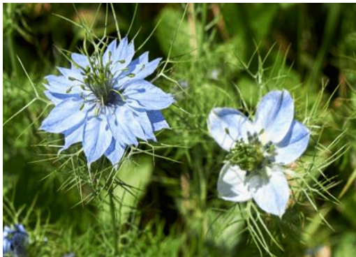
Figure 2. The Nigella sativa flowers (Rayhanah Group Sdn Bhd, 2024)

Nigella sativa (NS) is a widely used medicinal plant. It is an annual herbaceous flowering plant ( Figure 2 ) from the family of Ranunculaceae and is mostly grown or cultivated in South and Southwest Asia (Ramadan, 2016). Its seeds ( Figure 3 ) and oil have been used for centuries to treat various ailments (Tavakkoli et al. , 2017), and its efficiency is reported to be due to the different contained constituents. These include terpenes (thymoquinone, dithymoquinone, p-cymene, \alpha -pinene, limonene, carvone, anethol, etc.), steroids ( \alpha -hederin), alkaloids (nigellidine, negillidine, nigellidine, nigellidine-N-oxide), flavonoids (quercetin), saponins, fixed oil, coumarins, amino acids, and many others (Rajabian & Hosseinzadeh, 2020; Ahmad et al. , 2021). Thymoquinone is the major constituent of the NS oil contributing to its therapeutic potential as an antimicrobial, anti-inflammatory, and antioxidant.