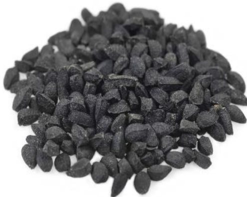
Figure 3. The Nigella sativa seeds (Melissa, 2024)