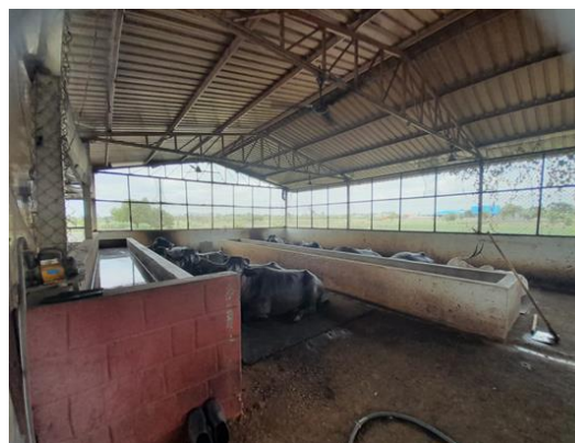
Figure 3. Animal husbandry

Farm income is slowly declining due to shrinking land holdings and continued non-integrated agriculture. Crops, dairy, fisheries, poultry, mushrooms, horticulture, sericulture, and other agricultural components must be integrated into a single farm unit to preserve farm income and also for sustainable agriculture (Pervez et al., 2021).