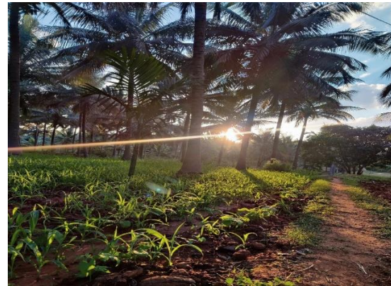
Figure 1. Coconut and pearl millet with chicken

Asia has been the birthplace of the integrated farming system of fish band rice farming, which has flourished since the dawn of civilization, especially as human communities began to move inland from river banks. Even though there are some successfully adopted fish and rice integrated farming system techniques in Asian continent countries, like India and China, the concept of agricultural-based pairing up, and a systematic combination of cultivation, aquaculture, and animal husbandry is still not widely used in these areas and yet to educate people (The paddy-field wetland is ideal for breeding and feeding a variety of fish ( Figure 1 ). Most spawnings in rice fields produce glue-like eggs that are generally arranged on green plants to provide extra oxygen and nutrition designed for maturing embryos (AL-Kattan et al. , 2019; Al-Rejaboo & Jalaluddeen, 2019; Falya et al. , 2021). However, shallow water net constructors and spawners breed in paddy fields under ideal conditions) (Paramesh et al. , 2022).