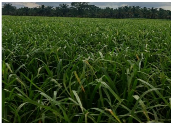
Figure 2. Rice fields in siruguppa

concerns. This type of farming benefits should reach the people widely, especially the millions of rural people who are not aware of this type of farming (Ahmed, & Garnett, 2011).