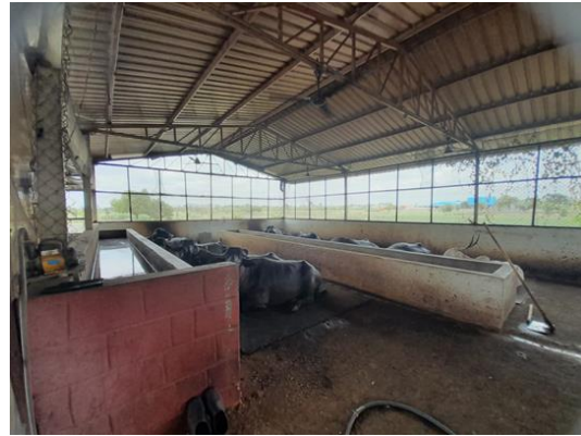
Figure 3. Animal husbandry