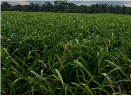
Figure 2. Rice fields in siruguppa