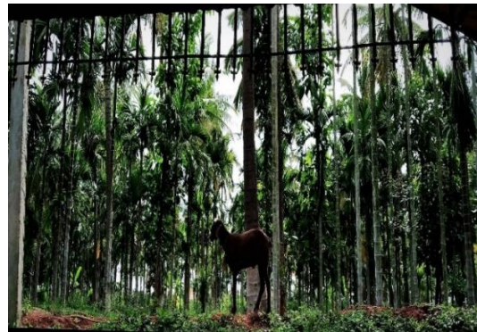
Figure 4. Coconut with Arecanut, black pepper plant, and goat farming in Vallegerehalli, Hassan district, Chanrayanpatna taluk, Karnataka.

Farm income is slowly declining due to shrinking land holdings and continued non-integrated agriculture. Crops, dairy, fisheries, poultry, mushrooms, horticulture, sericulture, and other agricultural components must be integrated into a single farm unit to preserve farm income and also for sustainable agriculture (Pervez et al. , 2021).