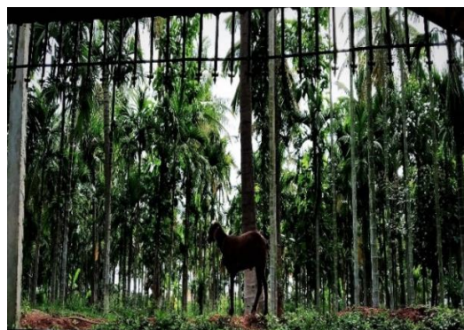
Figure 4. Coconut with Arecanut, black pepper plant, and goat farming in Vallegerehalli, Hassan district, Chanrayanpatna taluk, Karnataka.